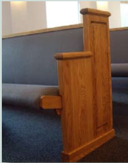
600 with Cap