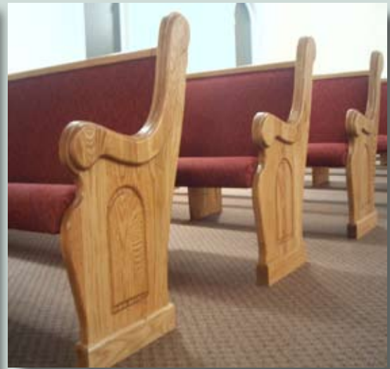
900 with Cap