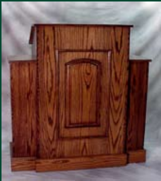
#210 Antique Style

Contact us now so that we may discuss your church furniture needs.