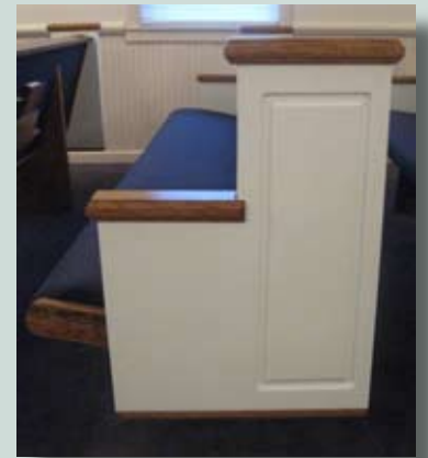
C-600 with Cap