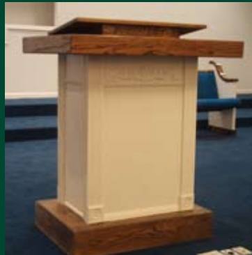
#310 White Pedestal