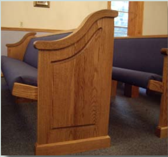
400 End with Cap