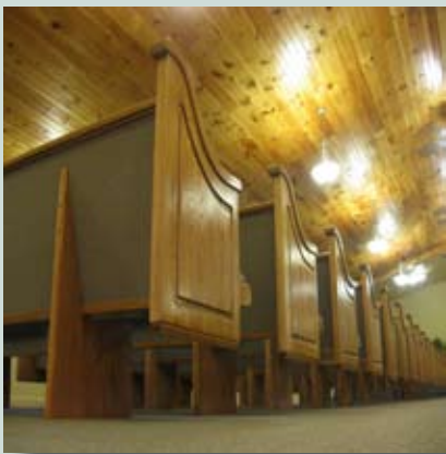
C-400 End with Cap

In the padding department, our pews are designed for comfort, with a 4” cushioned seat and with lumbar support in the right place to help align back muscles and offering a most comfortable seat and back combination. Our pews are crafted by Americans at the factory in Oklahoma, in the center of the United States!