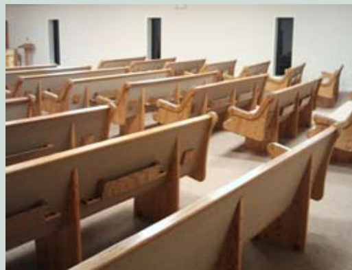
Standard bookracks included